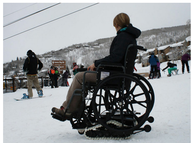
The Freedom Trax FT 1 Pro on the slopes, courtesy of the livingspinal.com website.

The Freedom Trax FT 1 Pro track attachment for manual wheelchairs is made in the United States and comes with a 24 volt lithium battery, two 24 volt motors, and a handheld joystick and charger. The track attachment can be adjusted for wheel-widths between 18 and 26 inches, making it a great long-term choice for users who anticipate updating their wheelchairs. The track itself is roughly eighty pounds and can handle sand, snow, hiking trails, and more. The lithium battery lasts up to eight miles on soft soil with backup batteries available for purchase. ◇