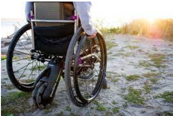
Permobil Smart Drive MX2+ in action, courtesy of the permobil.ca website.

One of the most popular Power Assist tools on the market is the Permobil Smart Drive MX2+ , which is compatible with the Apple Smart Watch or Permobil's PushTracker E2 smart watch. The Smart Drive attaches to the back of a wheelchair's camber bar and the battery is positioned under the user's seat. Permobil boasts Smart Drive is the lightest rear power assist in the world at 13.2 pounds, with the ability to climb at 10-degree inclines. The maximum operating speed is 5.5 miles per hour, and the driving range is up to 12.3 miles. This technology is not intended for use over significantly rough terrain, extreme slopes, or loose ground.