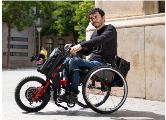
Batec Electric Handbikes in use, courtesy of the batec-mobility.com website.

hour and wheel sizes range from 12 to 19 inches, with the option to purchase off-road wheels to replace a wheelchair's existing wheels. It is worth noting that Batec Handbikes are awaiting FDA approval for use in the United States as of 2022.