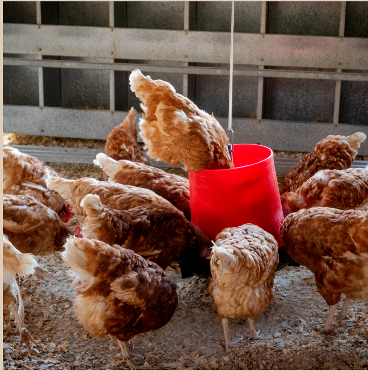
A flock of chickens enjoy a morning snack.